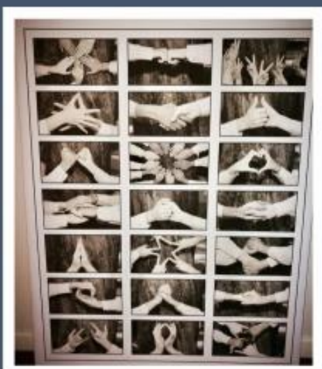
Yr 5 Photograph on Canvas