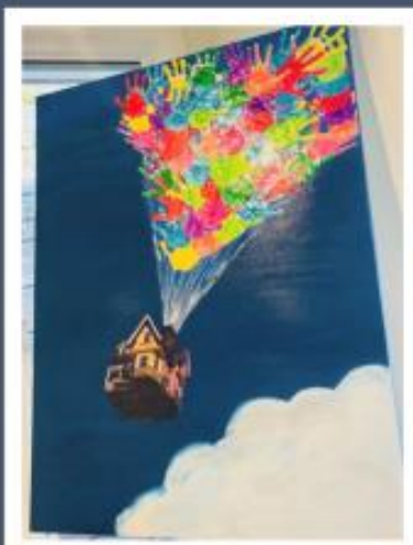
Yr 2 Acrylic & Collage on Canvas