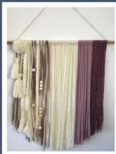
Yr 3 Hand-crafted Woollen Wall-Hanging