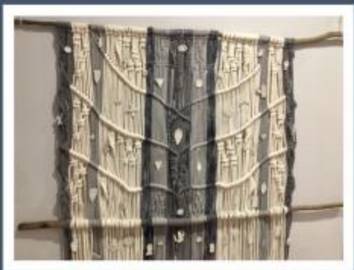
Yr 6 Macramé wall-hanging with ceramic ornaments

If you are unable to attend but would like to bid, please ask a friend to bid on your behalf.