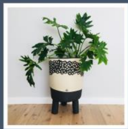
Yr 4 Handcrafted Ceramic Planter