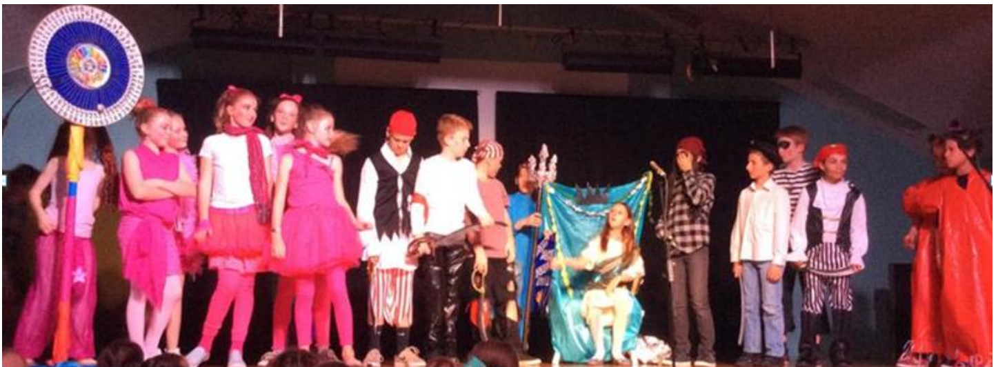
Stage 3 students and the Italian Song Club were the stars of the musical Kids at Sea performed on Wednesday. The whole school, along with a few parents and grandparents, were treated to a matinee performance after morning