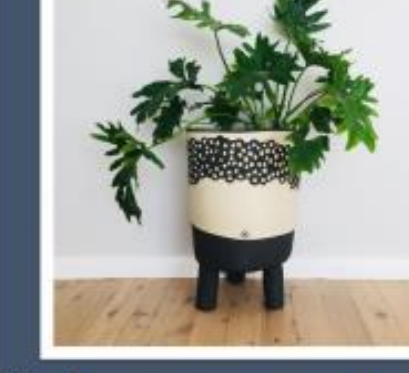
Yr 4 Handcrafted Ceramic Planter